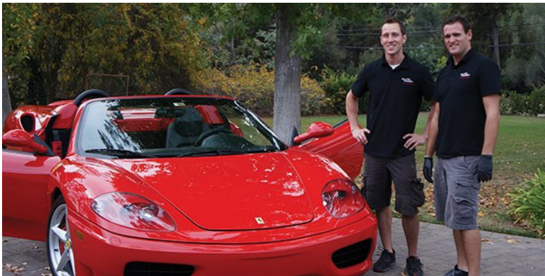
Elite Detail Finishing

There's a new kid in town...two actually. And they're really not that new. But they are masters of the FINEST and Waterkeepers of the future. Pioneering a grassroots campaign of a waterless car wash coupled with the applied artistry of "nano-particles of silica", an innovative coating known as, C.Quartz FINEST®, these master detailers have become the 'go-to' for exclusive show room, high performance automobiles and private, luxury car enthusiasts.