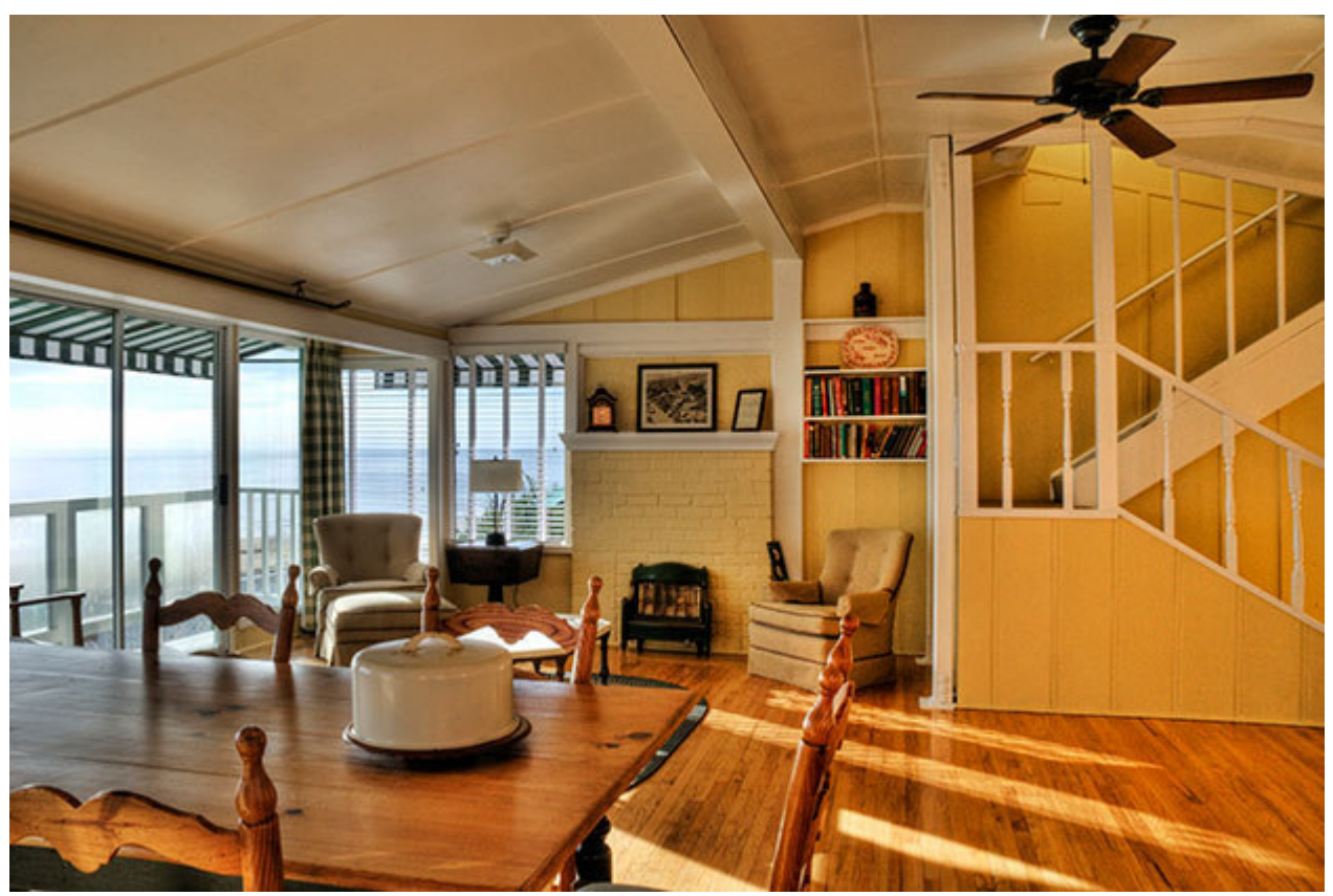
Crystal Cove Beach Cottages Location: 35 Crystal Cove, Newport Beach Cost: From $162 Travel Time: 2 Hours by automobile Contact: